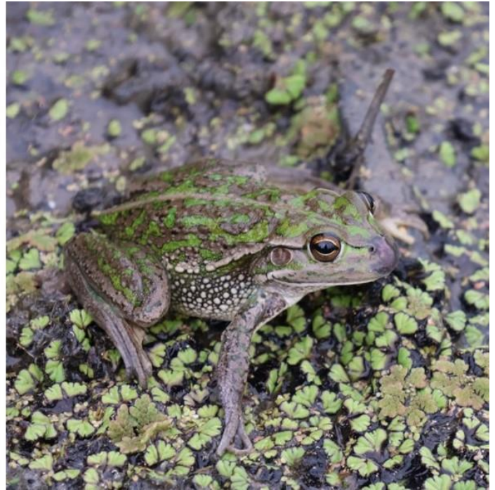
Left to right. 1. Audio moth equipment installed along weir pools by ecologists to monitor frog calls. 2. Southern Bell Frog spotted at River mint lagoon, SA.